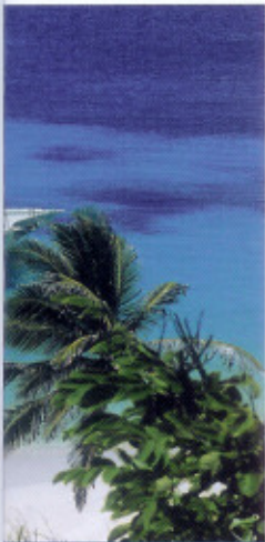
Chart the courses of the great explorers Columbus and Sir Francis Drake and discover uninhabited islands and cays. Drop anchor off palm fringed beaches or coves. Visit harbors in which notorious pirates like Blackbeard and Captain Kidd once held court, where colorful West Indian architecture now delights the eye.

Relax completely on the vast deckspace afforded by Promenade's tri-hull design, or, at your whim, enjoy the many recreational activities on board. Step ashore for a little beach combing along the water's edge or to visit a local boutique. The choice is yours.